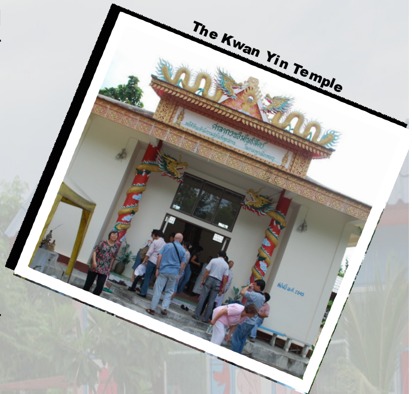
The Kwan Yin Temple