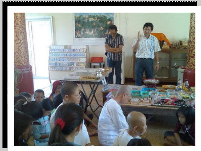
In Buddhist Temples