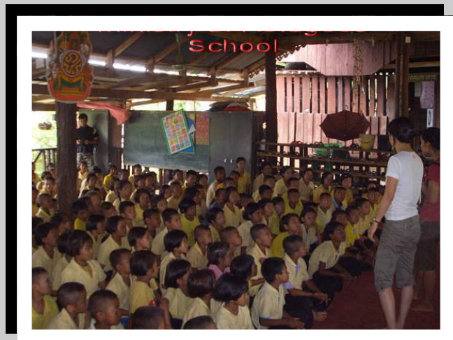
In Public Schools