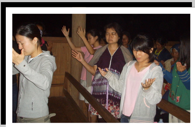
In Tribal Village Churches