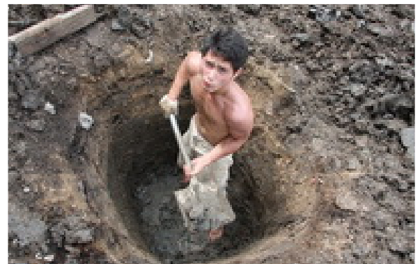
Digging The Sewage Hole