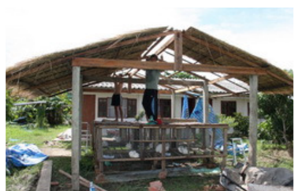
Fixing The Roof Of The Rabbits' Hutches