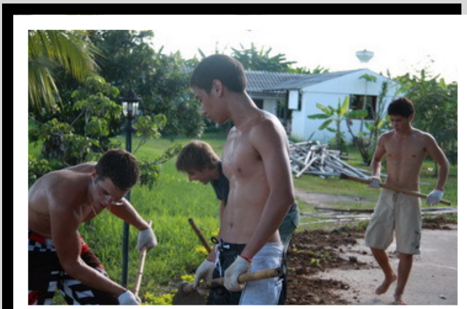
Making Underground Wiring Trench